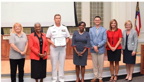
Union Grove H.S.