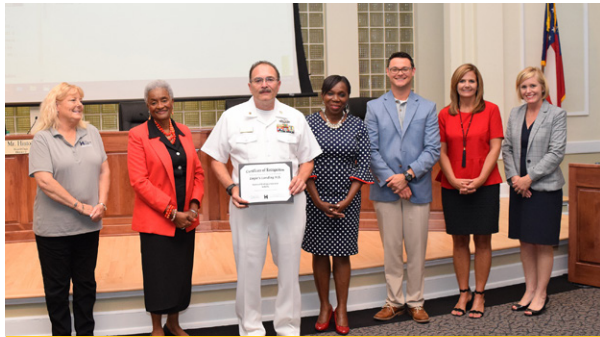
Eagle's Landing H.S.